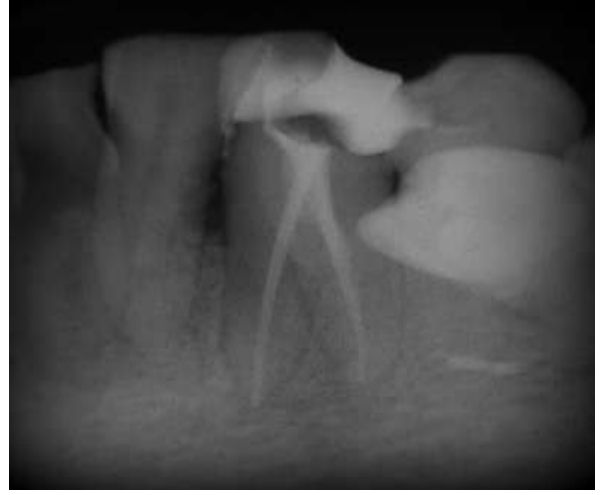
Fig6: Obturation IOPAR