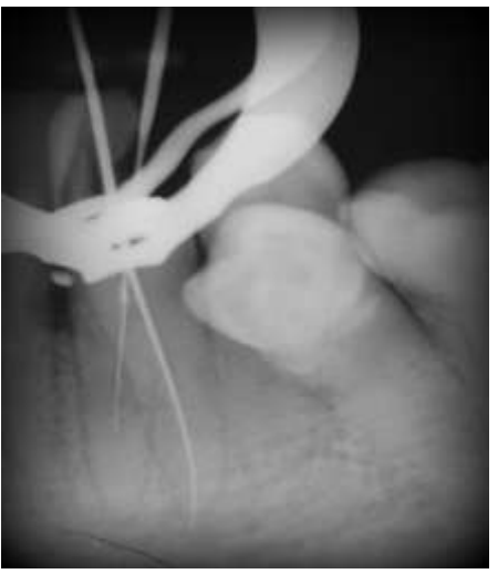
Fig4: Working Length IOPAR