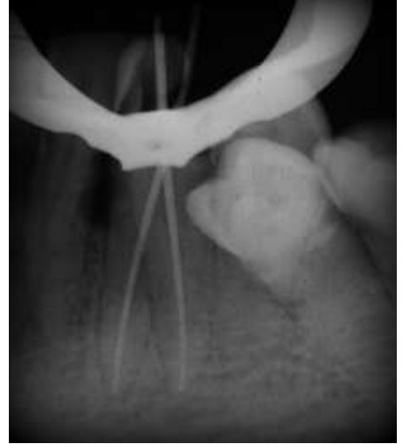
Fig5: Master Cone IOPAR